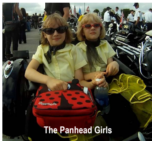
The Panhead Girls